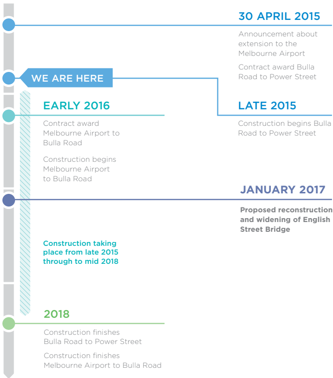
Key milestones timeline